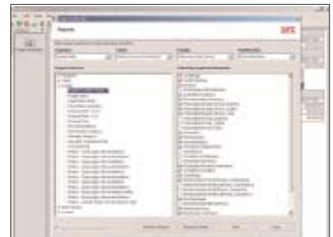
The reporting tool combines a detailed reporting library with easy to select sorting options.