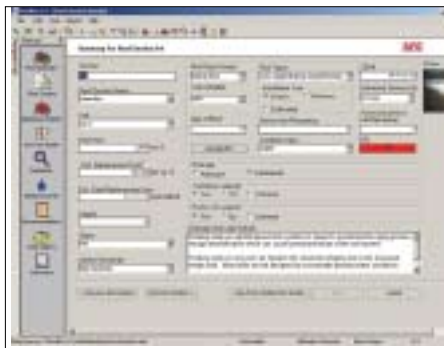
Detailed Roof information is organized in the industry leading format.