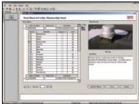
Import and organize digital photos into photo albums, then add these photos to your roofing data.